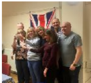
The current winners to beat