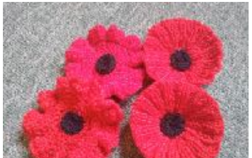
These are examples of the two knitted poppies: on the left is the first pattern, on the right the second pattern.

Or use a black or green button with 4 holes and sew to centre of poppy.