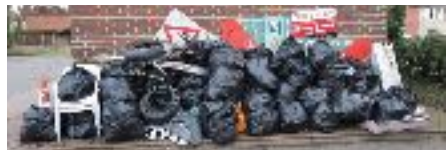
Last year's haul - can we do better this year?