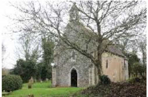
St Nicholas church, Boarhunt

This is a walk from the Red Lion in Southwick that takes us initially west through part of the vast Southwick estate toward Fareham through Lodge Farm, past the former Boarhunt Mill and then along the Allan King footpath to the local church at Boarhunt. There follows a rather steep climb up to the Nelson monument after which we return to Southwick by an elevated route from which, if the weather is good, we will be able to enjoy wonderful views toward Southwick House and the South Downs.