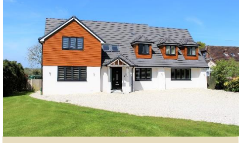
Uplands Road, Denmead 5 Bedrooms - £1,300,000