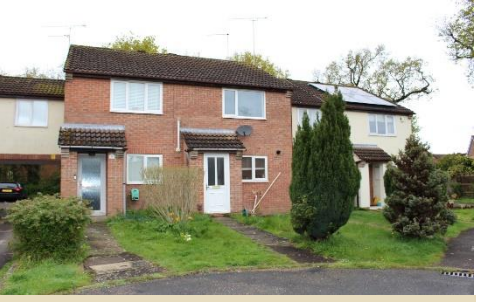
Kilnside, Denmead 2 Bedrooms - £270,000