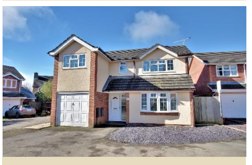
Peakfield, Denmead 5 Bedrooms - £560,000