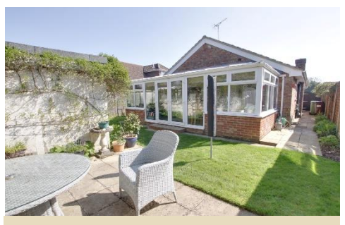
Harvest Road, Denmead 3 Bedrooms - £475,000