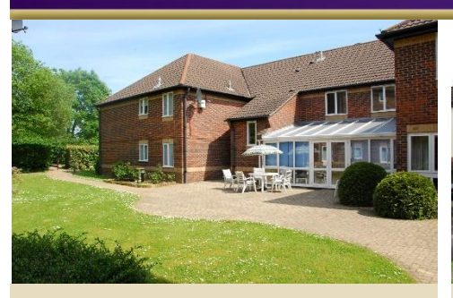
Home Mead, Denmead 1 Bedroom - £125,000