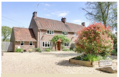
Furzeley Corner, Denmead 3 Bedrooms - £650,000