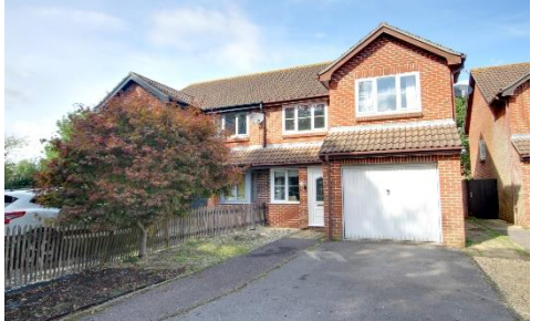
The Smithy, Denmead £395,000 – 3 Bedrooms