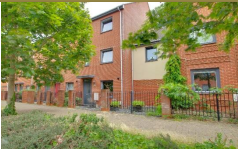
Cumberland Row, Waterlooville £395,000 – 4 Bedrooms