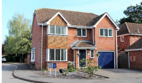
The Liberty, Denmead £485,000 – 4 Bedrooms