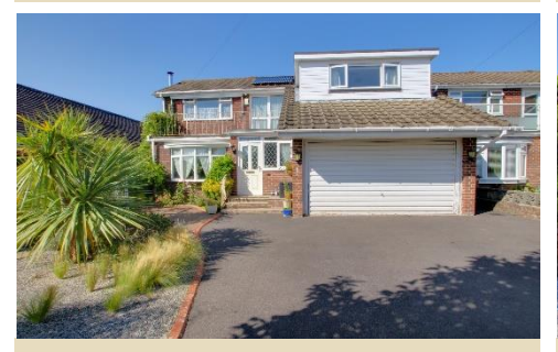
Park Road, Denmead £600,000 – 4 Bedrooms