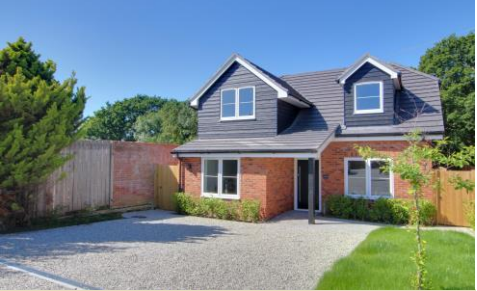
Hambledon Road, Denmead OIEO £800,000 – 4 Bedrooms

Denmead: 023 9225 9151 | Clanfield: 023 9259 1717 | Waterlooville: 023 9226 2611