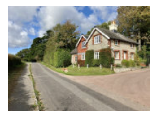
Entrance lodge to Purbrook Heath House

6.15km/3.8miles After emerging onto Purbrook Heath Road turn R and head downhill. At the road junction go ahead in the direction of Southwick. Stay on this lane for some distance