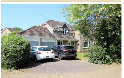
Pond Piece, Denmead £640,000 – 5 Bedrooms