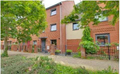
Cumberland Row, Waterlooville £395,000 – 4 Bedrooms