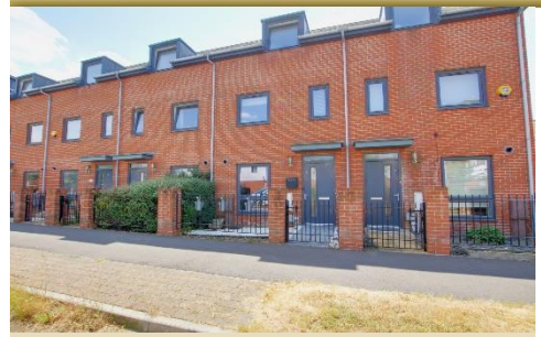
Tamworth Road, Waterlooville £320,000 – 3 Bedrooms