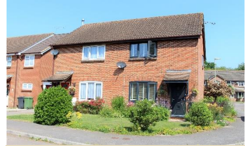
Woodrow, Denmead £350,000 – 3 Bedrooms