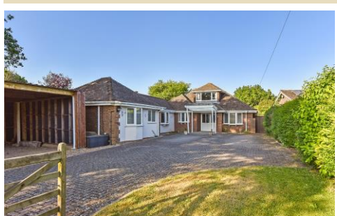
Sheepwash Lane, Denmead OIEO £800,000 – 4 Bedrooms

Denmead: 023 9225 9151 | Clanfield: 023 9259 1717 | Waterlooville: 023 9226 2611