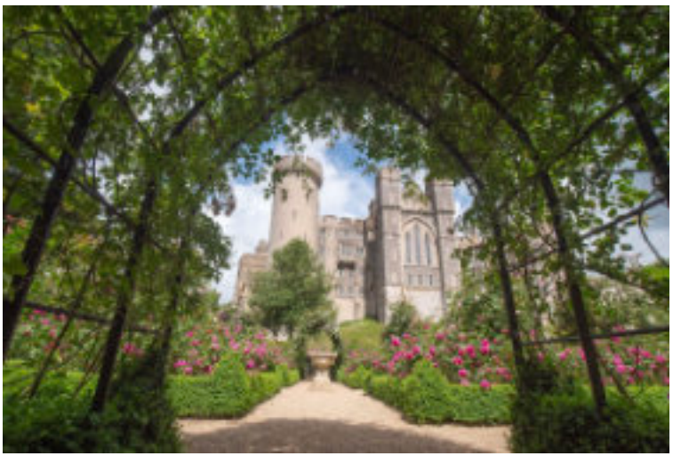
Wednesday 19th June 2024