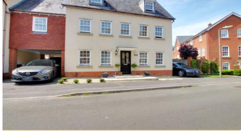
Hatchmore Road, Denmead £600,000 – 5 Bedrooms

Denmead: 023 9225 9151 | Clanfield: 023 9259 1717 | Waterlooville: 023 9226 2611