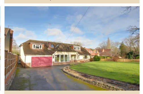
Uplands Road, Denmead £950,000 – 4 Bedrooms