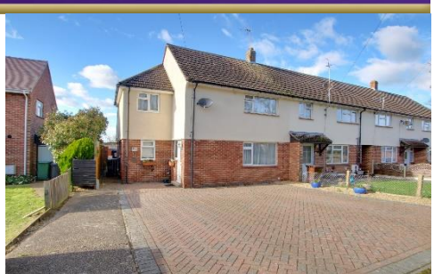
Castle Road, Southwick £415,000, 3 Bedrooms