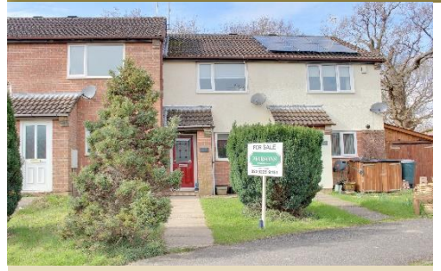
Kilnside, Denmead £250,000 – 2 Bedrooms