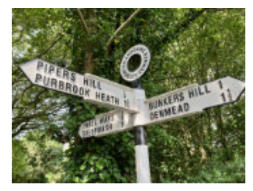
Figure 2: Finial post at Furzeley Corner

8km/5 miles At the next junction go L into Furzeley Road, then, a short distance beyond the entrance to the west side of the golf course, take a L turn onto the FP into Creech Wood. Stay on the path continuing in a straight line as far as the car park (CP) at the other end of the wood. Go R here, cross the CP then take the FP to the R about 30m before the entrance gate. Emerging onto Bunkers Hill bear R and head back to the starting point at the Harvest Home.