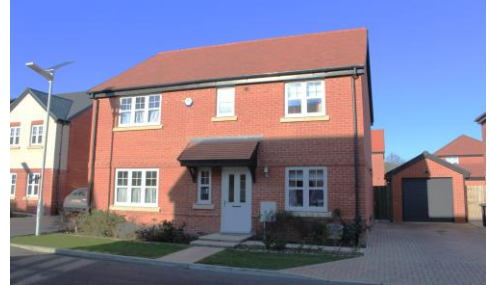
Kidmere Lane, Denmead £565,000 – 4 Bedrooms