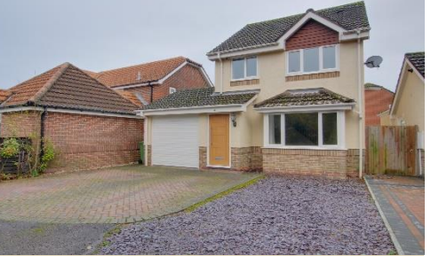
The Tithe, Denmead £425,000 – 3 Bedrooms