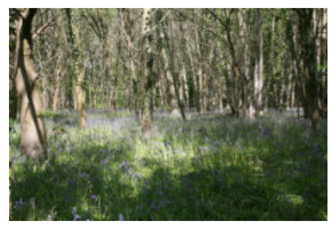
Figure 1: Assells Copse

2.2km/I mile Here go L and continue for 800m/872yards passing FP finger posts both on the L and R. As Beckford Lane bends to the right, go L onto the track leading to Beckford Green Farm. Stay on this gravel track for just under 300m/327yards until a gate appears ahead just as the lane veers L.