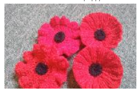
These are examples of the two knitted poppies: on the left is the first pattern, on the right the second pattern.

Using B, cast on 16 sts. Cast off. Coil into a tight spiral and sew base to the centre. Or use a black or green button with 4 holes and sew to centre of poppy.