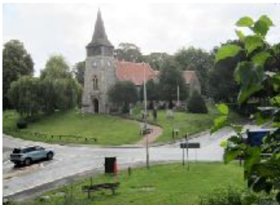
The Church of St Nicholas, Wickham

The starting point of this walk is the CP opposite the Shell garage at the south end of Wickham.