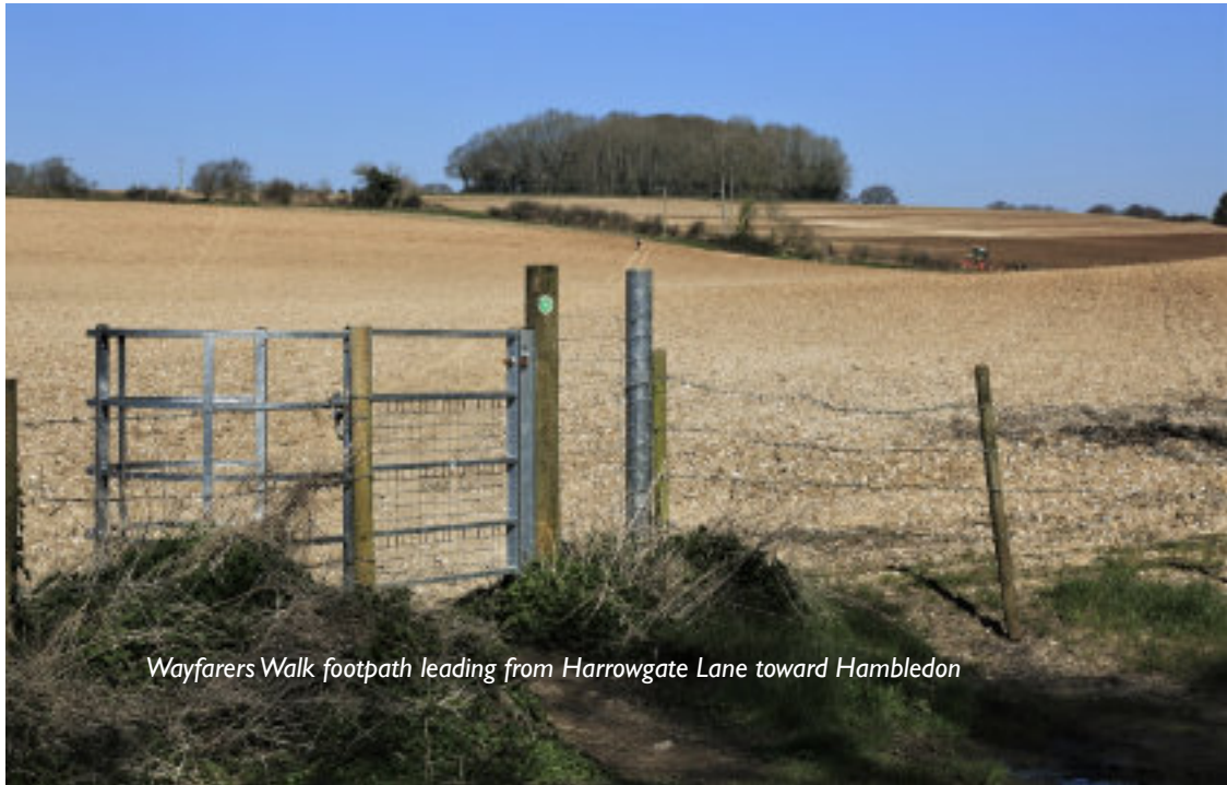
Wayfarers Walk footpath leading from Harrowgate Lane toward Hambledon

On reaching the latter turn L, go through the metal gate and stay on this path for some distance to a second gate. Go L at the lane then