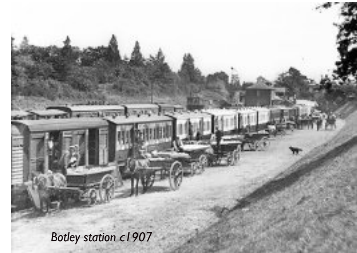
Botley station c1907

The trade prospered with the development of the railways and many areas of South Hampshire were now growing strawberries which were distributed to Southampton, Portsmouth, Salisbury and London. Botley station, opened in 1841, was the first to ship strawberries but Swanwick station built in 1888 became the main station for the trade. These stations were built with very long platforms to accommodate the strawberry trains with roads alongside for the horses and carts to queue.