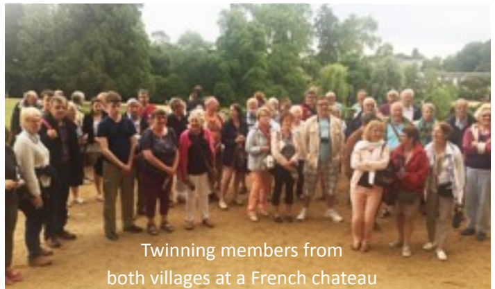
Twinning members from both villages at a French chateau